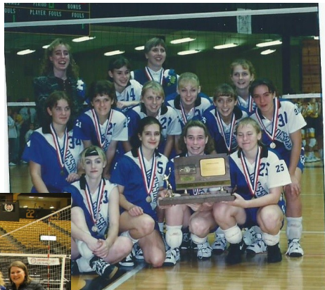
First team to go to State. 1996 Runner Up, Class 2A

The 2015 Volleyball Team didn't "Relent", until they held the record of 44-0 for the season!